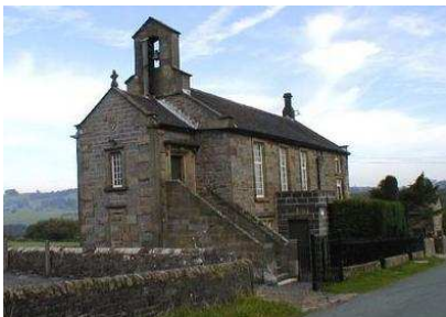
St. John's, Reapsmoor