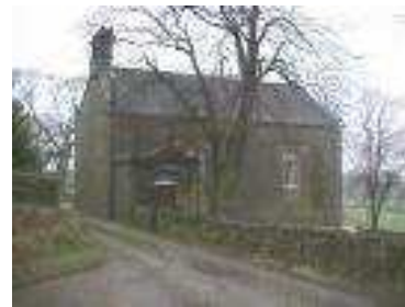
St. Paul's, Newtown