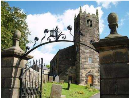
St. Bartholomew's, Longnor