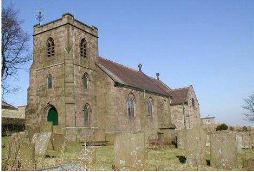
St. Paul's, Quarford