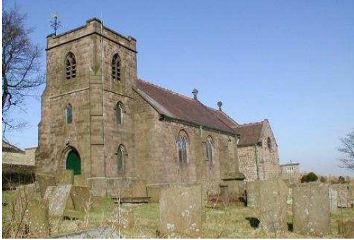
St. Paul's, Quarnford