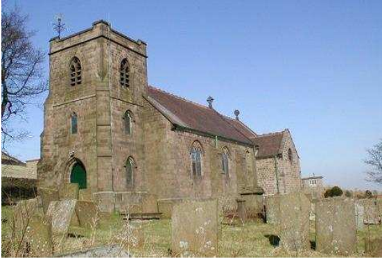
St. Paul's, Quarnford