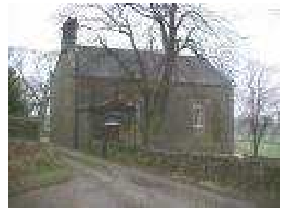
St. Paul's, Newtown