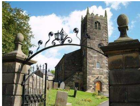
St. Bartholomew's, Longnor

February 2009 Longnor, Quarnford & Sheen with Newtown Hollinsclough, Reapsmoor & Hollinsclough