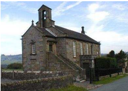
St. John's, Reapsmoor