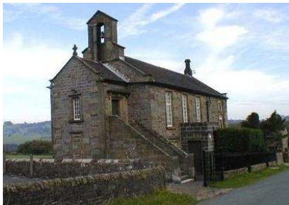
St. John's, Reapsmoor