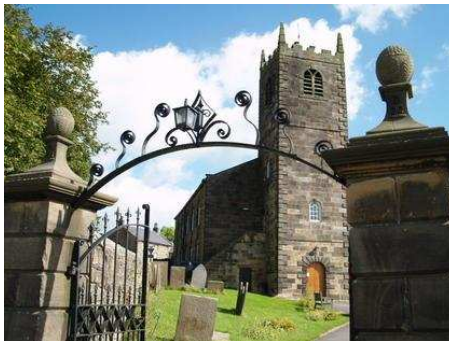
St. Bartholomew's, Longnor

Longnor, Quarnford & Sheen with Newtown Hollinsclough Longnor, Reapsmoor & Newtown