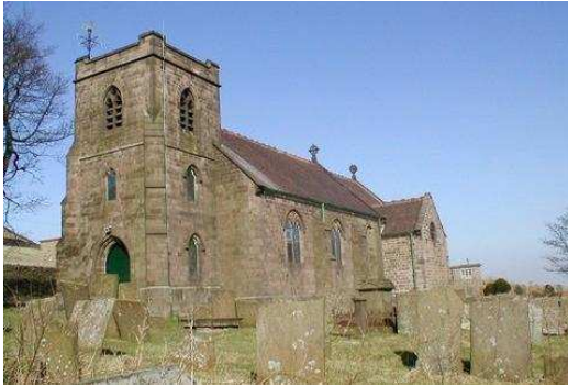
St. Paul's, Quarnford