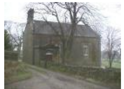
St. Paul's, Newtown