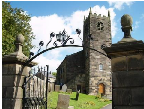
St. Bartholomew's, Longnor