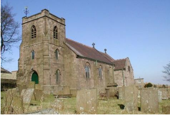
St. Paul's, Quarnford