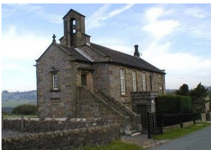
St. John's, Reapsmoor