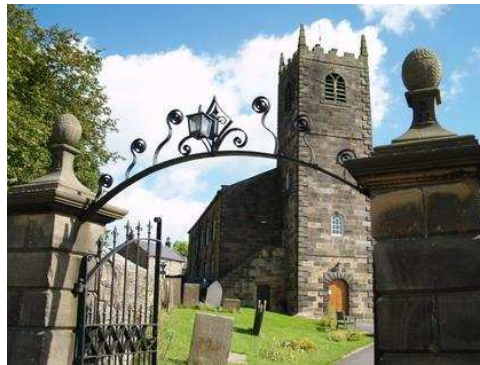
St. Bartholomew's, Longnor