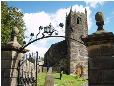
St. Bartholomew's, Longnor

Longnor, Quarnford & Sheen with Newtown Reapsmoor & Hollinsclough