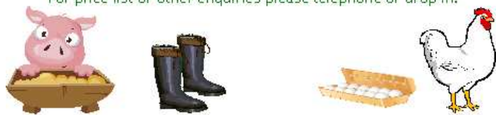
freshly laid eggs - £1.40 a dozen!!

For price list or other enquiries please telephone or drop in.