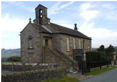
St. John's, Reapsmoor