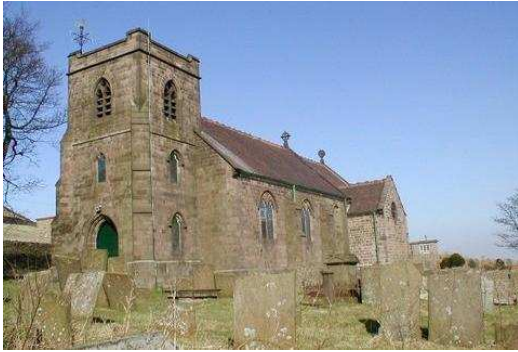
St. Paul's, Quarnford