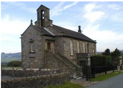
St. John's, Reapsmoor