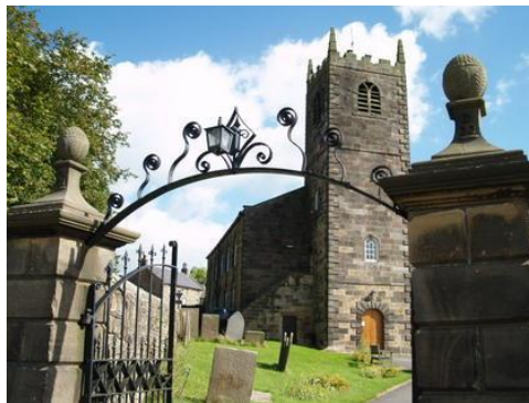
St. Bartholomew's, Longnor