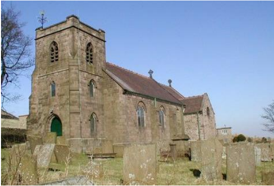
St. Paul's, Quarnford