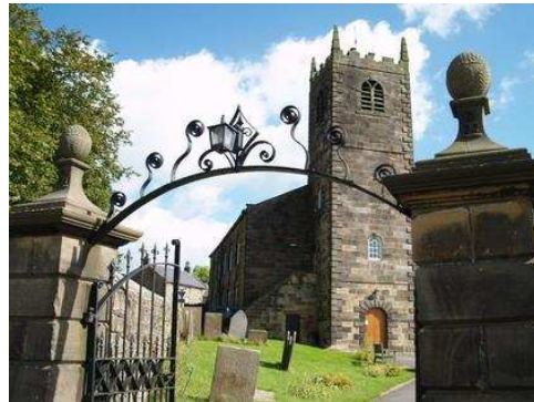
St. Bartholomew's, Longnor

Longnor, Quarnford & Sheen with Newtown Reapsmoor & Hollinsclough