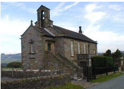
St. John's, Reapsmoor