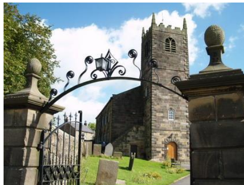
St. Bartholomew's, Longnor

Hollinsclough Longnor, Quarnford & Sheen with Newtown Reapsmoor & Hollinsclough Longnor