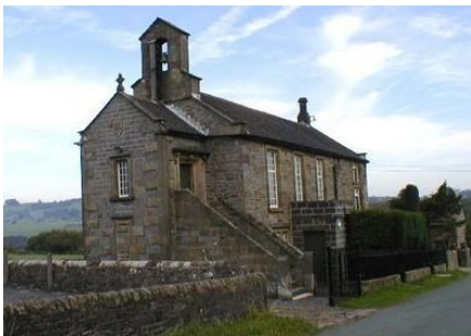
St. John's, Reapsmoor