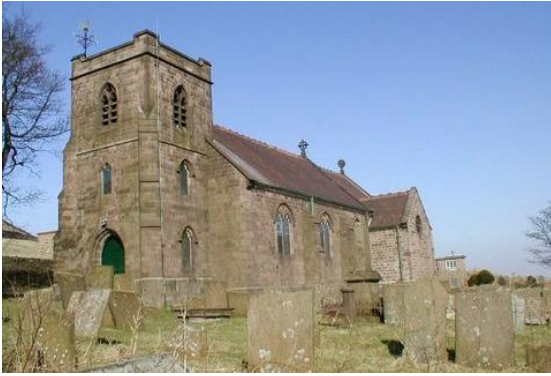
St. Paul's, Quarnford