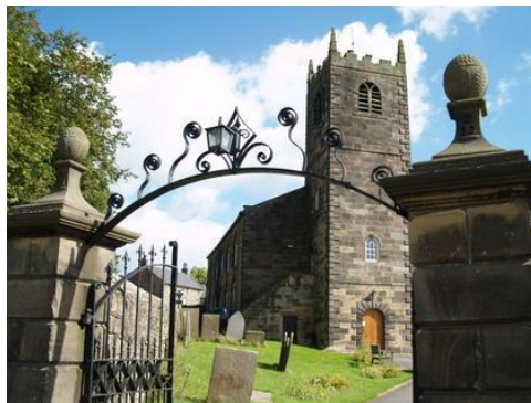
St. Bartholomew's, Longnor